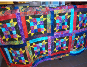
Quilt from previous year.

The parish Respect Life Group will have two raffles for the Parish Festival again this year. A hand made quilt and a furnished doll house. We will have them on display outside of church the weekends of Sept. 14 and Sept 21. You can buy your raffle tickets those two weekends and at the Festival too in the Respect Life Booth. The drawing will be on Sunday evening, Sept. 28, around 8 pm at the close of the Festival.